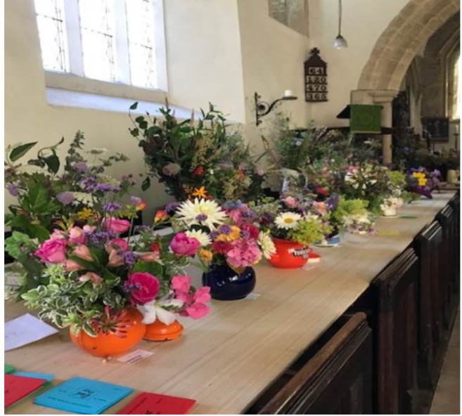
Some of the beautiful competition entries at the Cherington Show