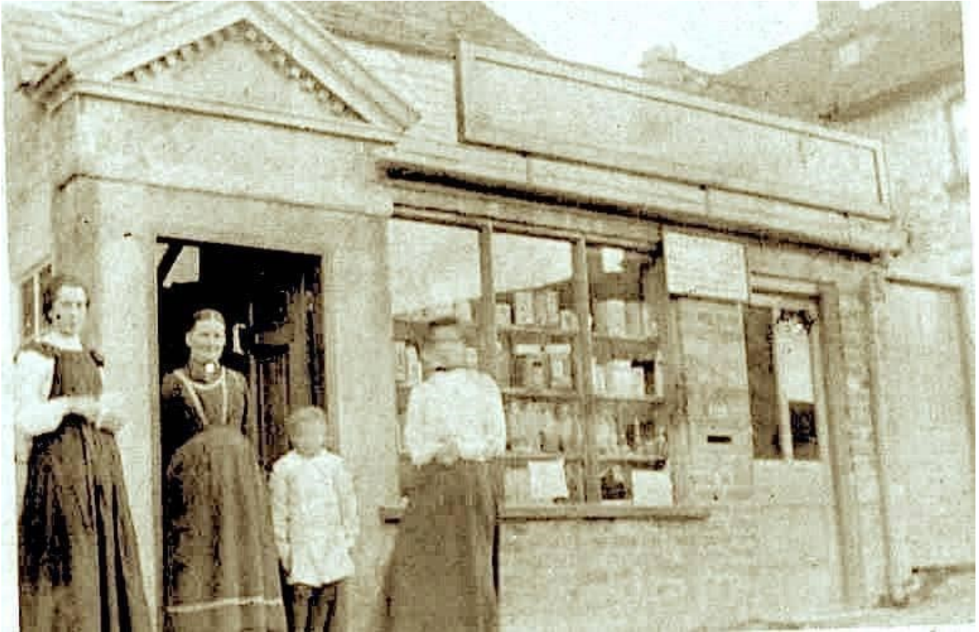
Avening Post Office at the bottom of Point Road c1900. With thanks to Derek King and the Old Avening and Cherington Facebook page