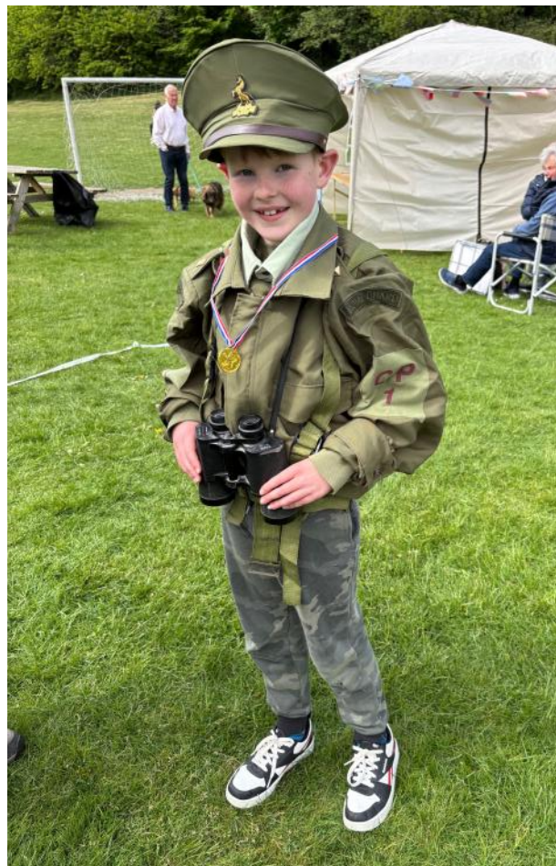
The best costumes of the afternoon