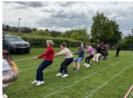
Maximum effort at the Tug of War!