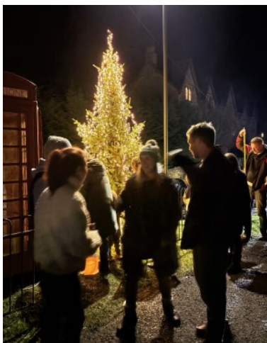
Lighting the Christmas Tree