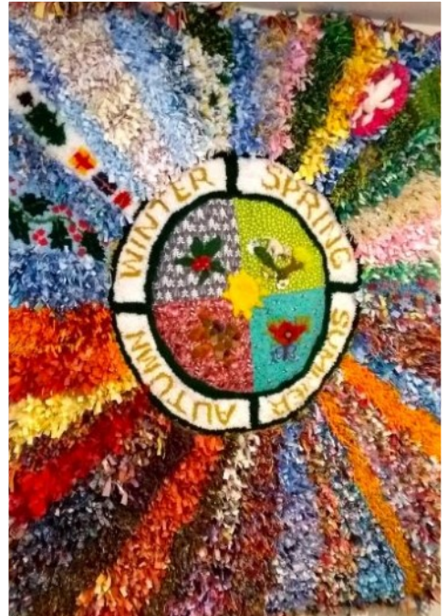
The Four Seasons – the latest Avening Community Café rag-rug wall hanging.

10th March – Café AGM at 7pm – All welcome.