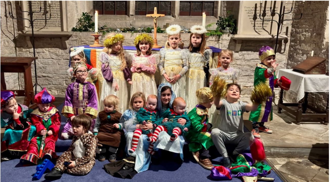
The Nativity scene at December's Crib Service