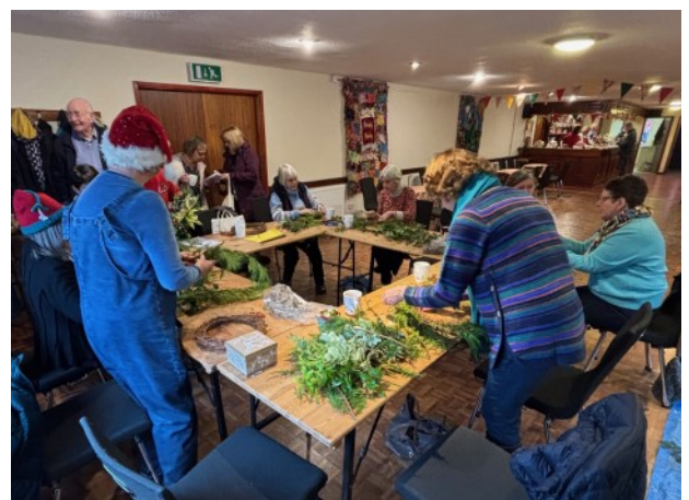
Wreath making at the Community Café