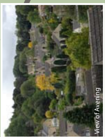
View of Aveing